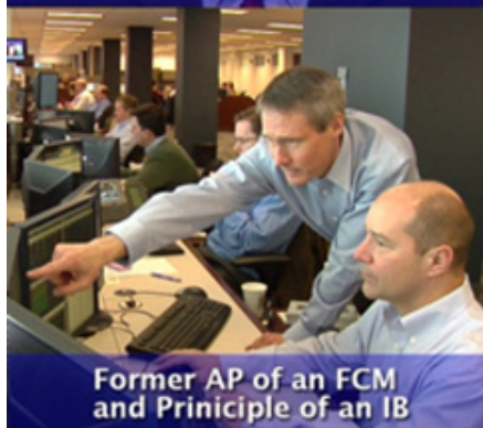
Former AP of an FCM and Principle of an IB