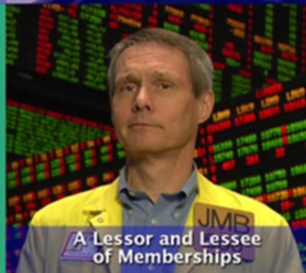
A Lessor and Lessee of Memberships