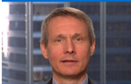
CME Group Board of Directors since 2009