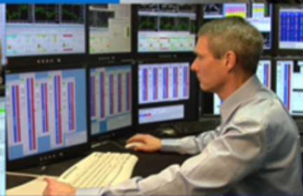
Active Individual Trader CME Member since 1979