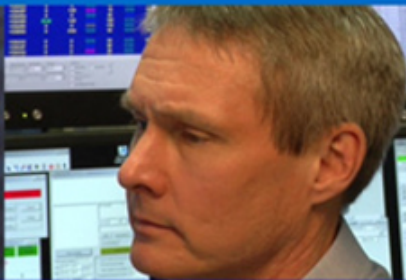
Member of CME Group Board Audit and Risk Committees